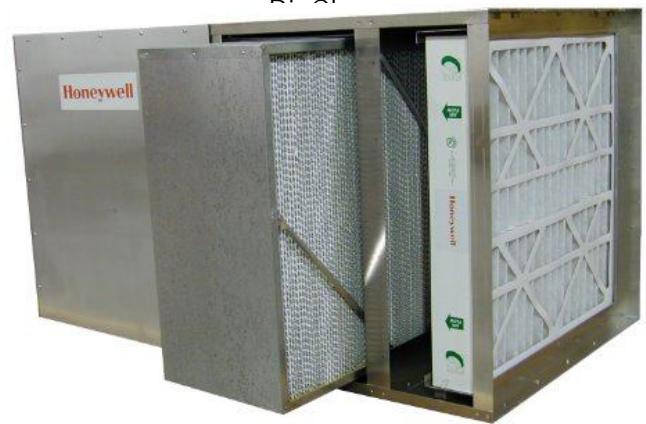
Shorter cabinet: Uses one pre filter with one primary filter.

Longer cabinet: Uses one pre filter with two primary filters.