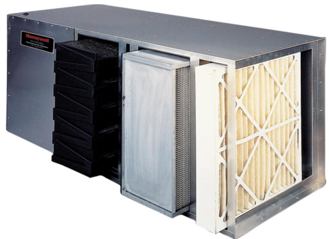
Longer cabinet: Uses one pre filter with two primary filters.

The VentDepot BigClean Honeywell F116 Series of Air Purifiers have a 2 year manufacturer's warranty.